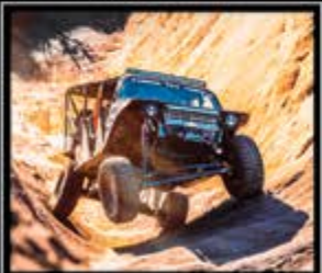
4X4 Tours » Scenic or Xtreme