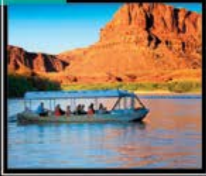
Sunset Jet Boat with Dinner