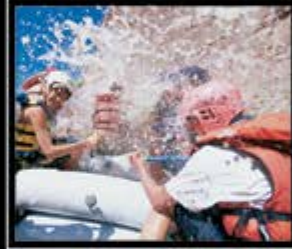
Rafting, Rivertubing, SUP & Canoeing