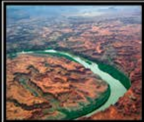
Air Tours » Plane or Helicopter