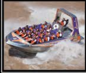
Spin & Splash Jet Boat » Cool Off!