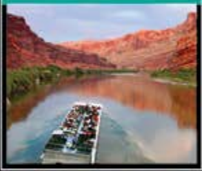
Sound & Light Show with Dinner