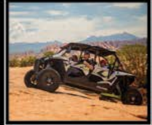
UTV Tours & Rentals