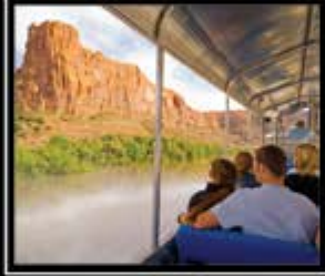
Daytime Jet Boat Tours » 1 or 3 hours