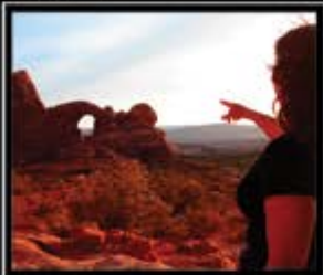
National Park Tours » Morning or Sunset